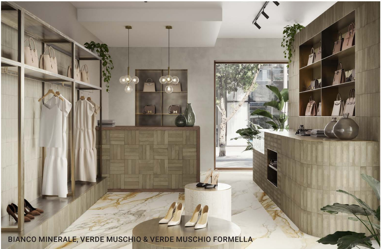
BIANCO MINERALE, VERDE MUSCHIO & VERDE MUSCHIO FORMELLA