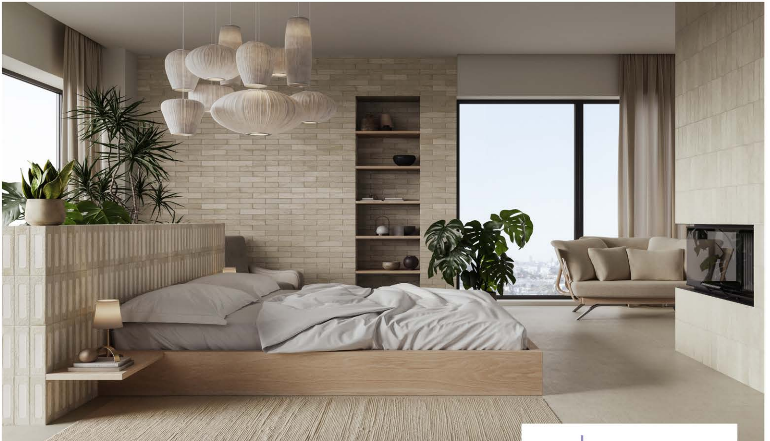
ARGILLA NATURALE FORMELLA, ARGILLA NATURALE & BIANCO MINERALE