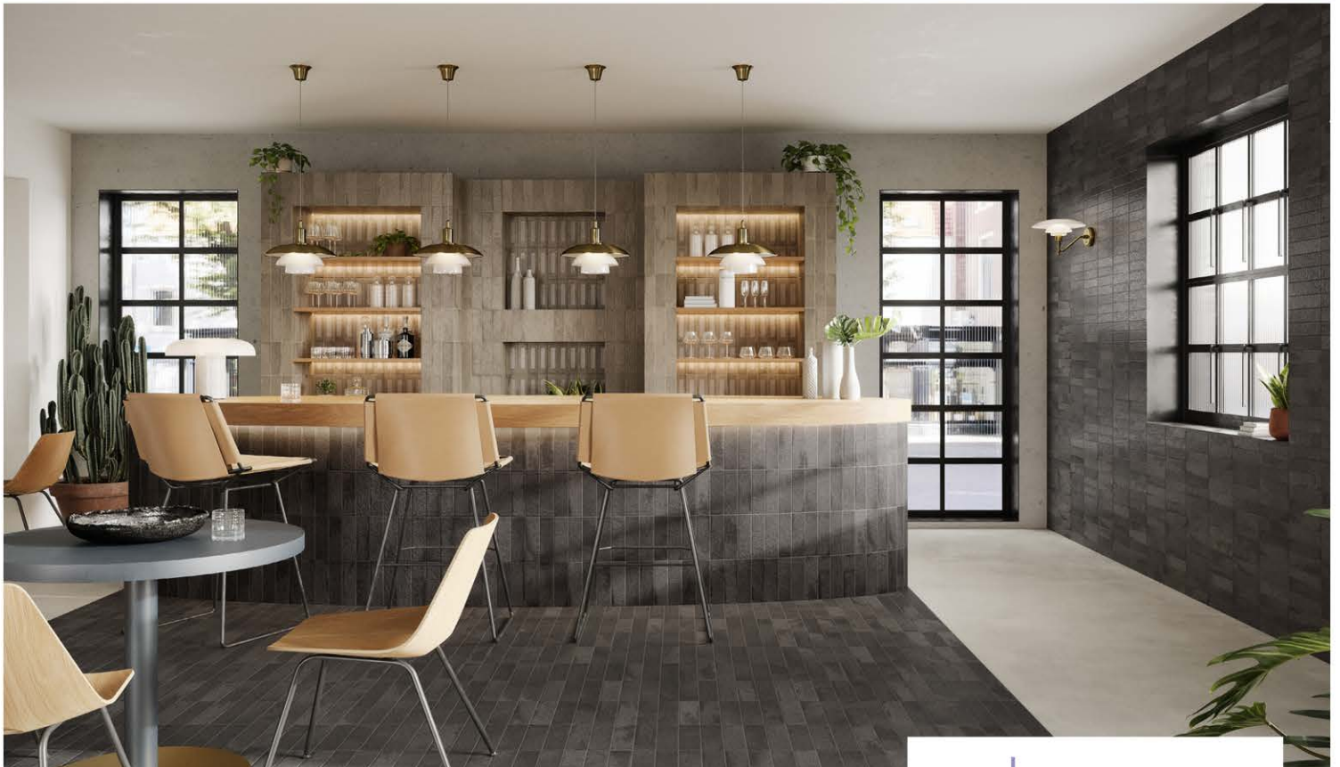
NERO FUMO, BRUNO BISTRO & BRUNO BISTRO FORMELLA