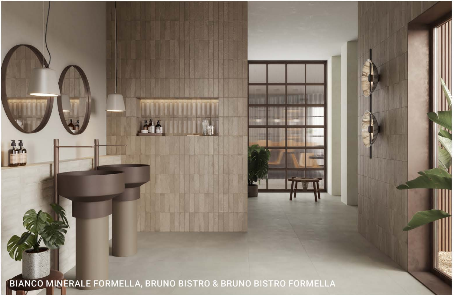
BIANCO MINERALE FORMELLA, BRUNO BISTRO & BRUNO BISTRO FORMELLA