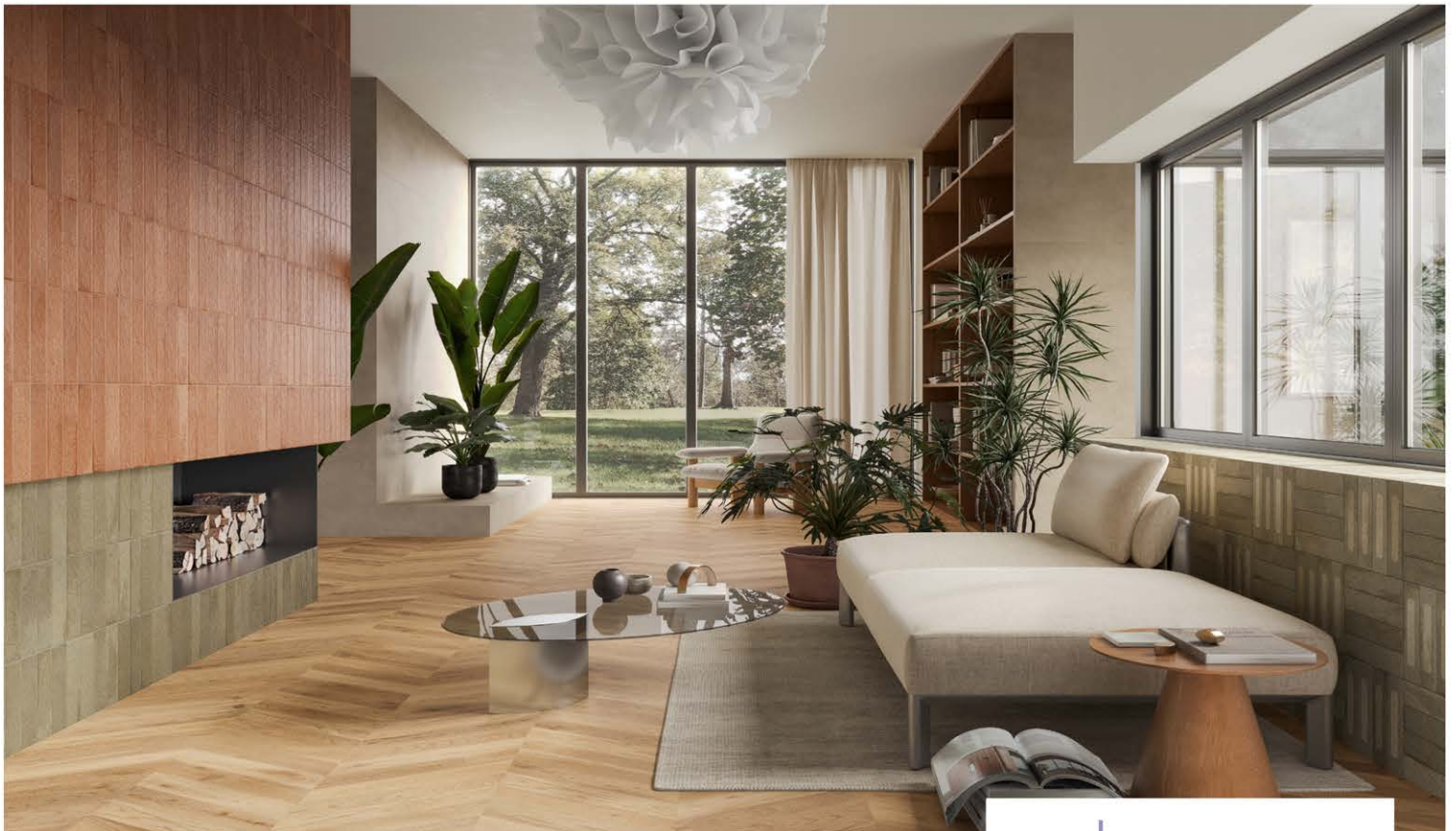
VERDE MUSCHIO, ROSSO MATTONE & VERDE MUSCHIO FORMELLA