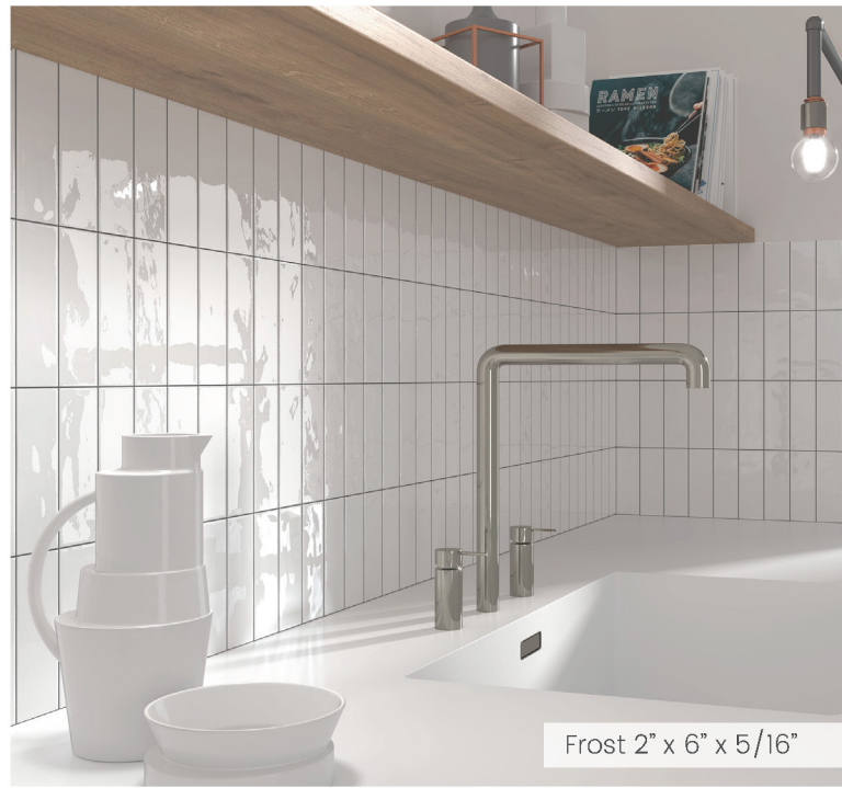
Frost 2" x 6" x 5/16"