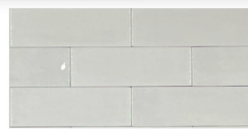
Frost 2" x 6" x 5/16"