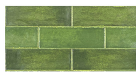
Hunter Green 2" x 6" x 5/16"