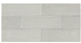
Silver 2" x 6" x 5/16"