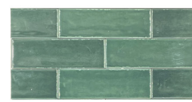
Forest Green 2" x 6" x 5/16"