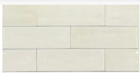
Beige 2" x 6" x 5/16"