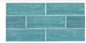
Turquoise 2" x 6" x 5/16"