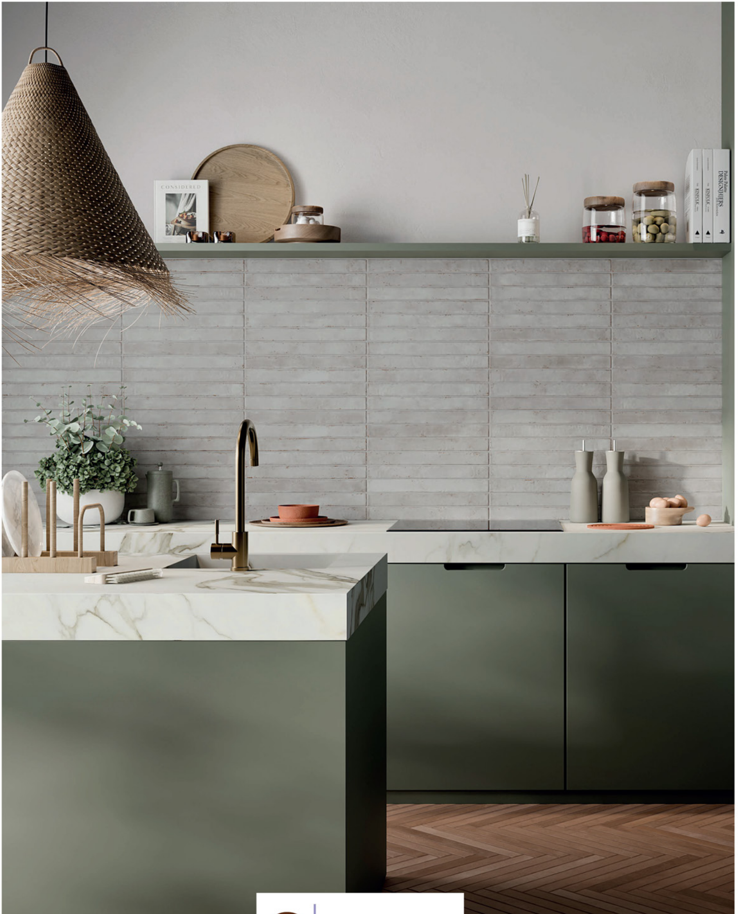
LIGHT GREY Matte