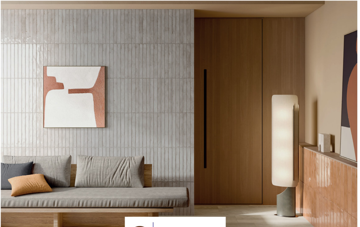
LIGHT GREY Glossy