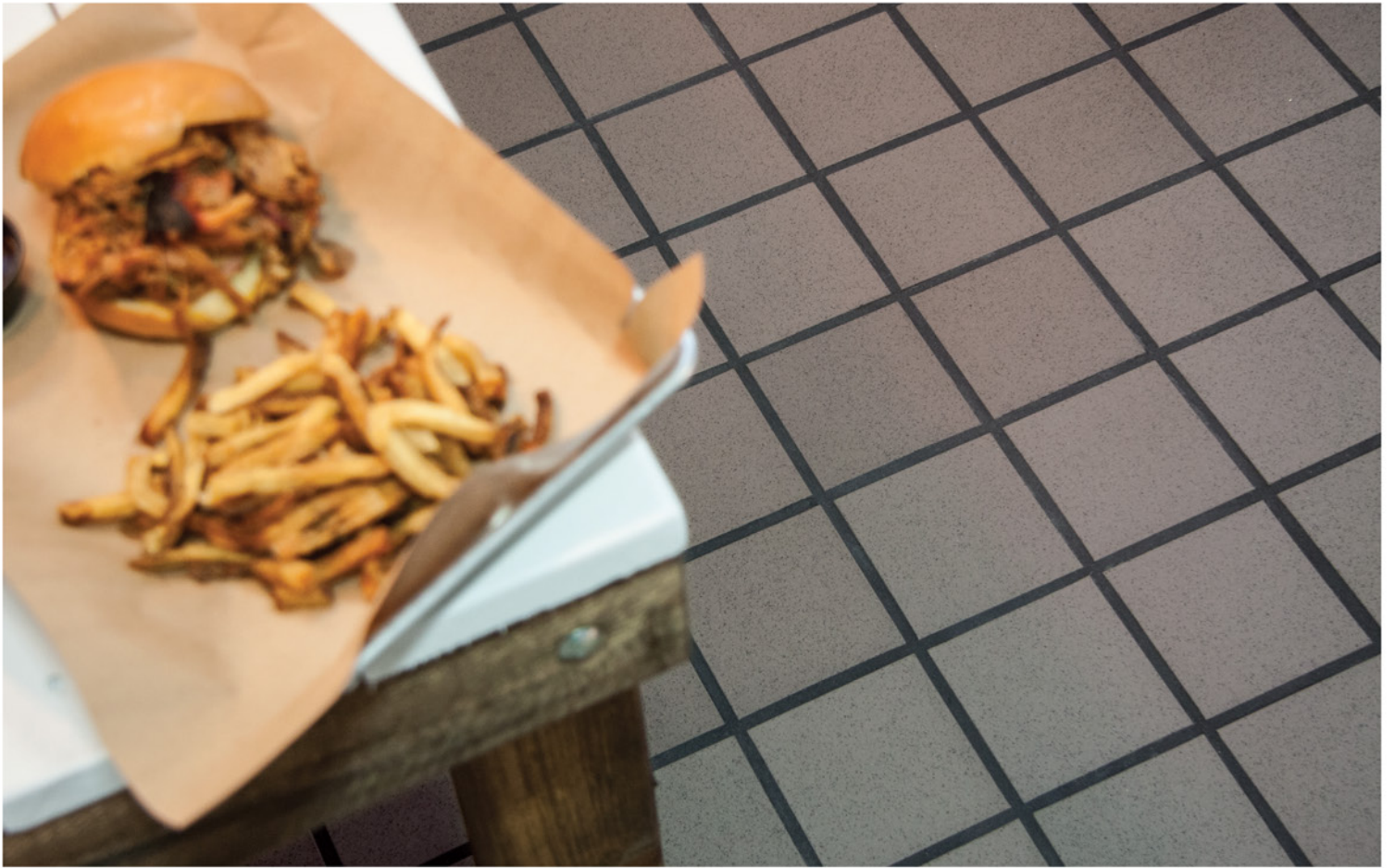
PURITAN GREY - Abrasive