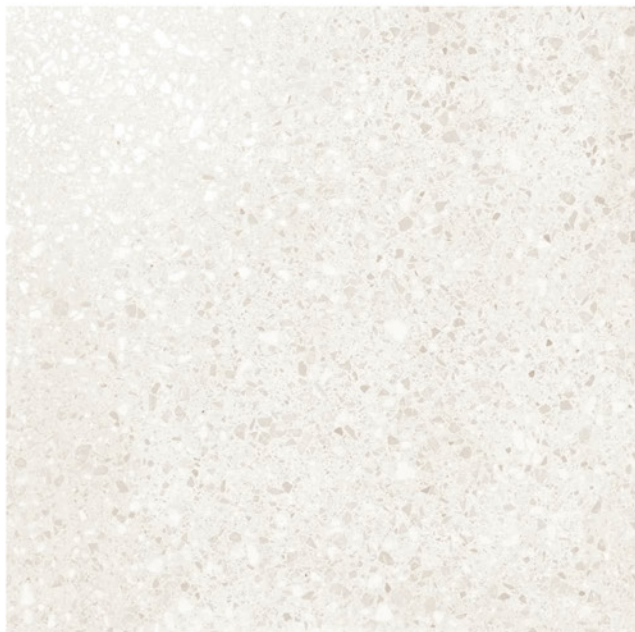
WHITE - Matte Finish