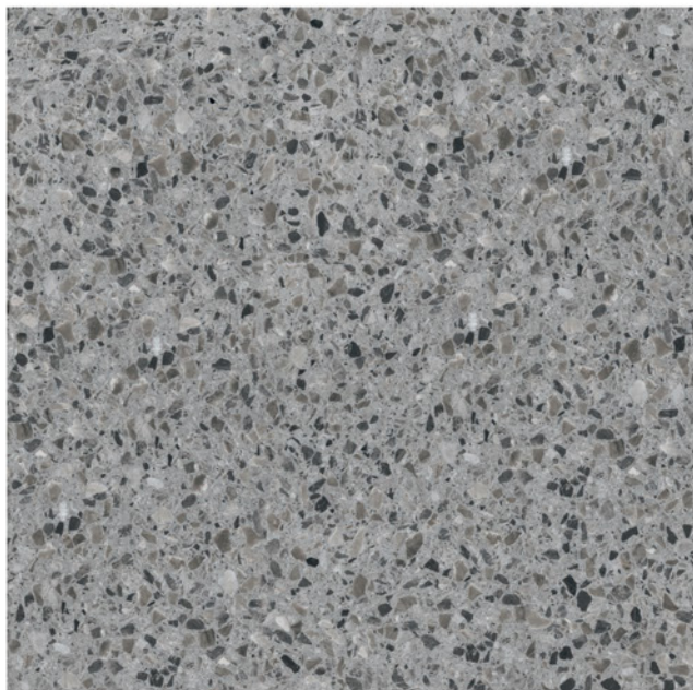
GREY - Matte Finish