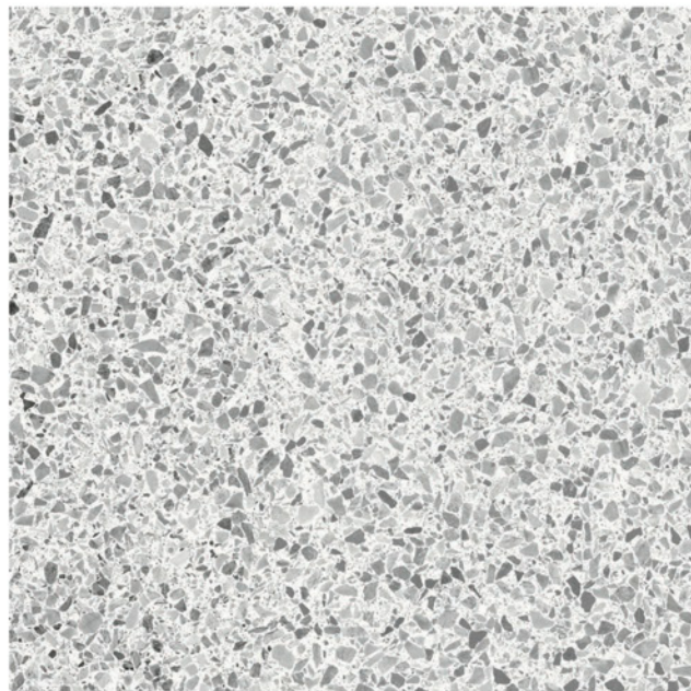
PEARL - Matte Finish