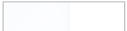
Arctic White Matte 4" x 16"

Items shown above are part of our stocking program.