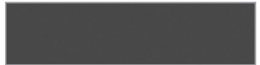
Plain Dark Grey Bright 4" x 16"

Items shown above are part of our stocking program.