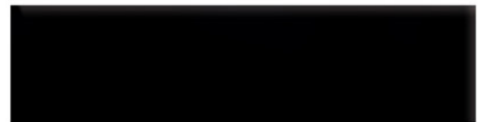
Plain Black Bright 4" x 16"

Items shown above are part of our stocking program.