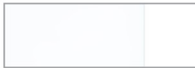
Arctic White Bright 4" x 12"