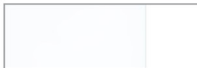
Arctic White Matte 4" x 12"