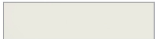
Plain Bone Bright 4" x 16"

Items shown above are part of our stocking program.