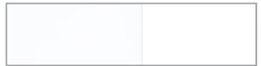
Arctic White Bright 4" x 16"