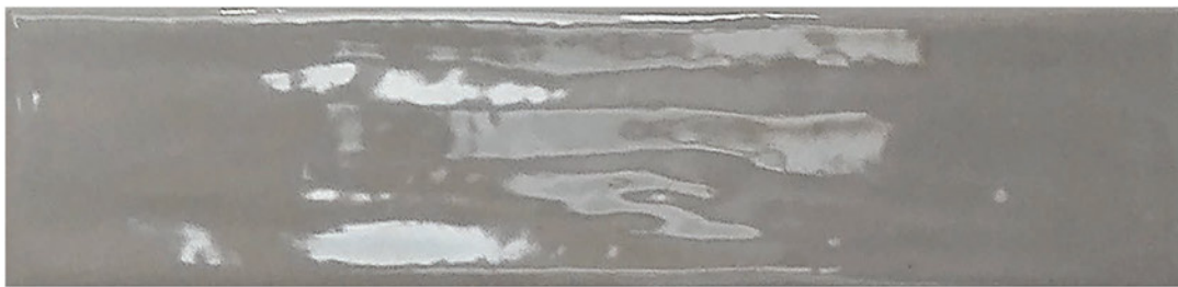
SMOKE Glossy Finish