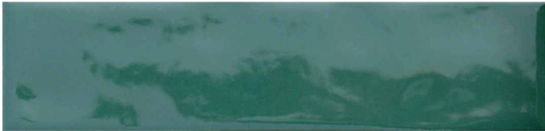
GREEN Glossy Finish