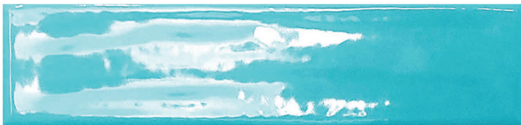
MALDIVE Glossy Finish