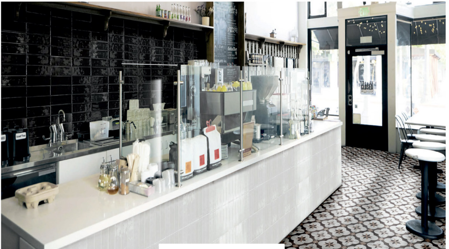
BLACK & PEARL