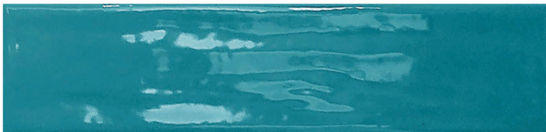
EMERALD Glossy Finish