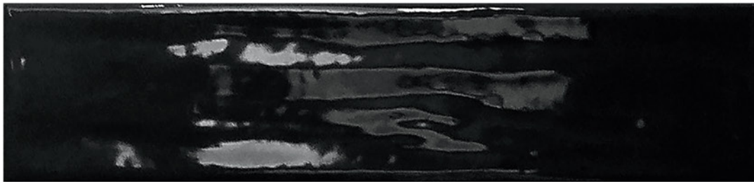
BLACK Glossy Finish