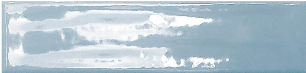
JEANS Glossy Finish