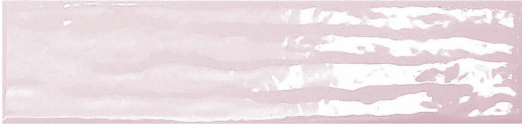
PINK Glossy Finish