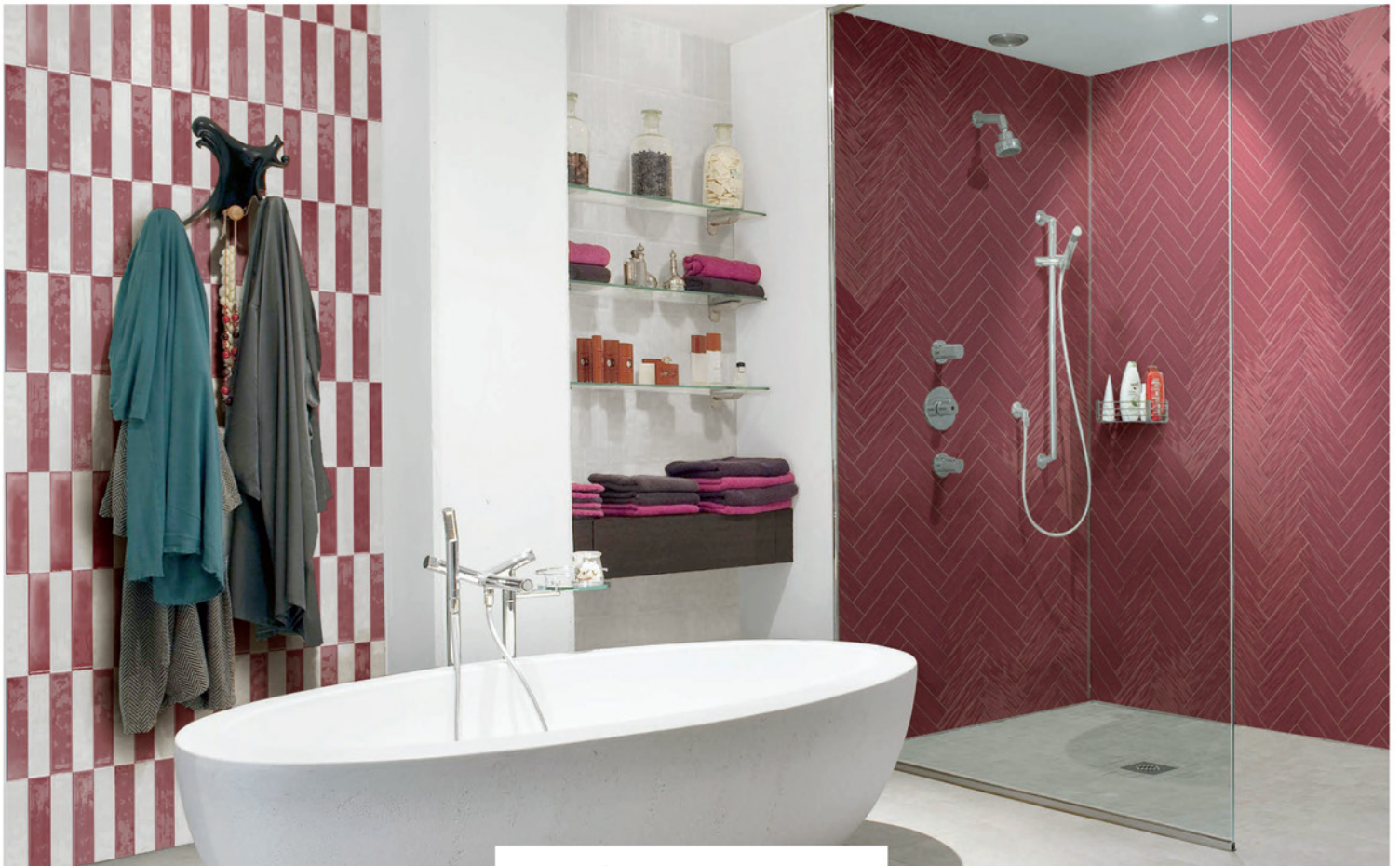
CHERRY & WHITE