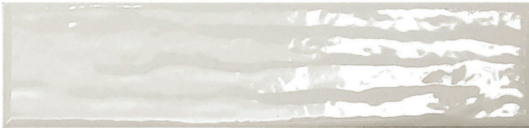
PEARL Glossy Finish