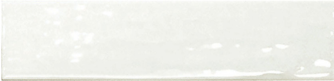
WHITE Glossy Finish