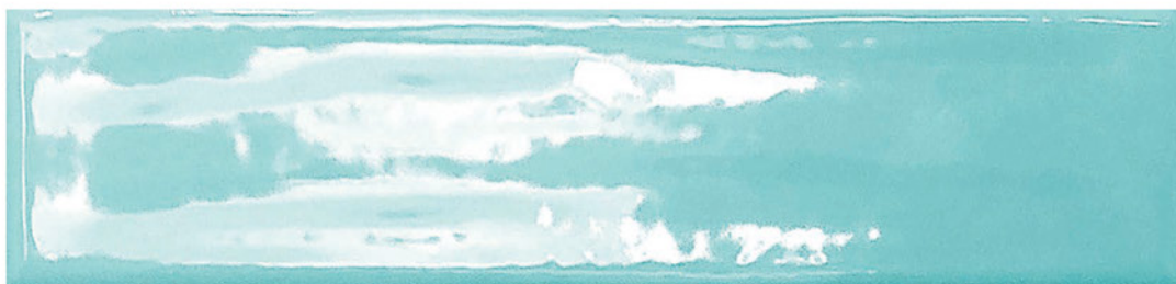
AEQUA Glossy Finish