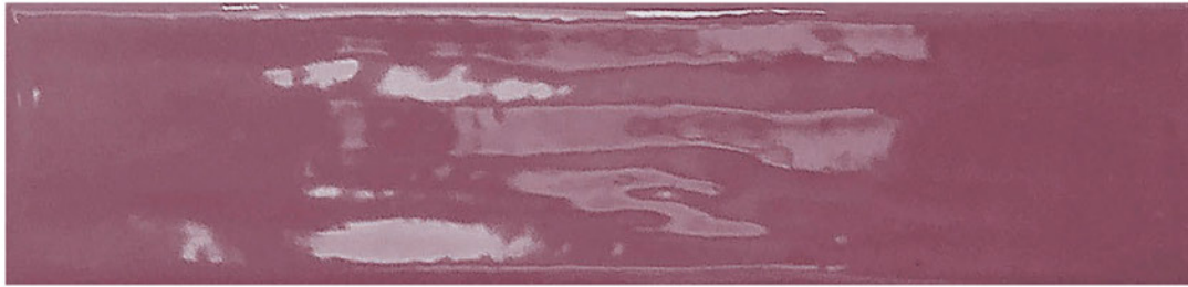
CHERRY Glossy Finish