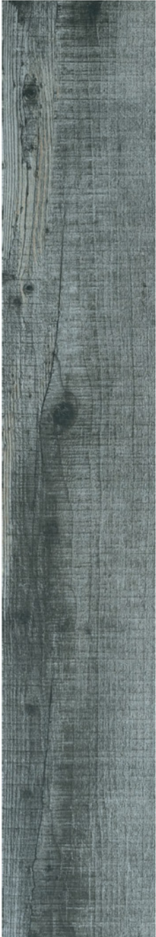
8" x 48" Matte