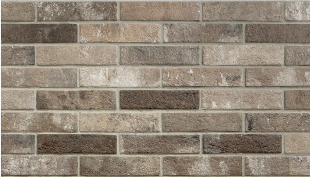
6cm x 25cm (2.3" x 10")