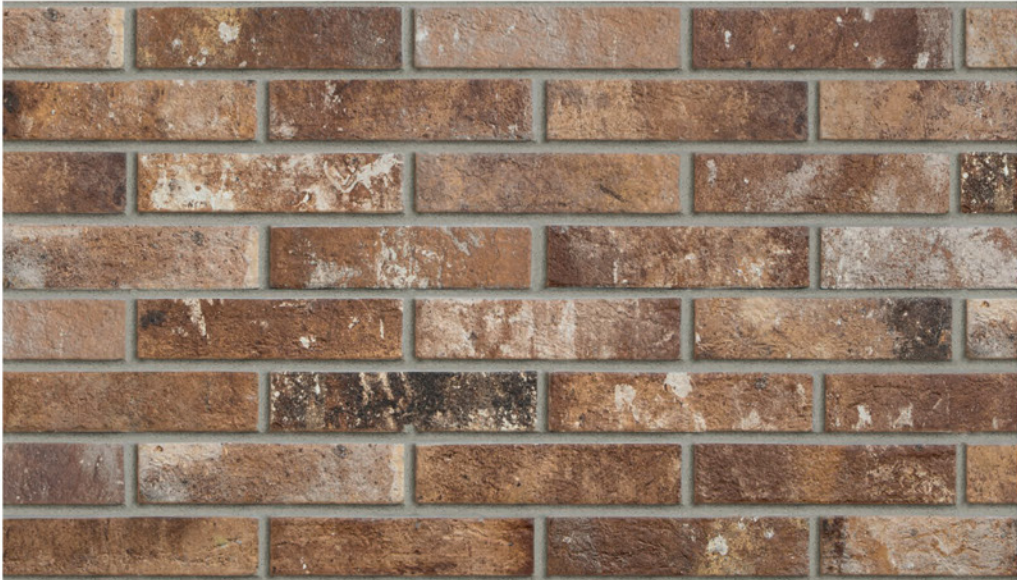
6cm x 25cm (2.3" x 9.8")