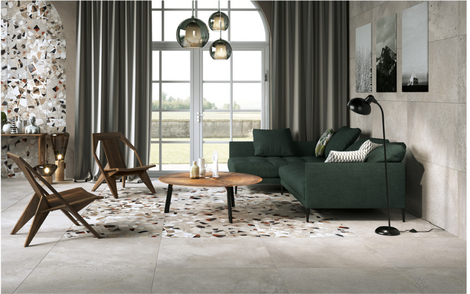
CENERE (Grey) & CENERE (Grey) Decor