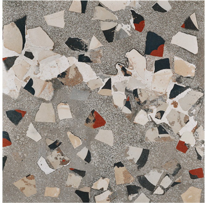
90 x 90 cm (36 x 36)