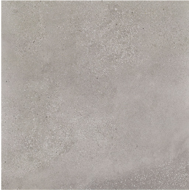
90 x 90 cm (36 x 36)