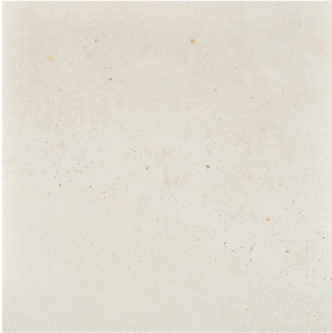
CALCE (Off White)