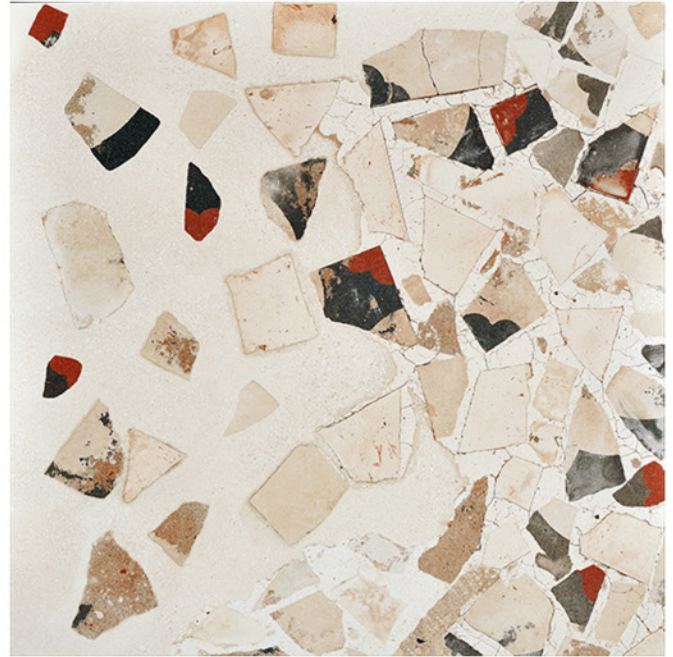
CALCE (Off White) DECOR