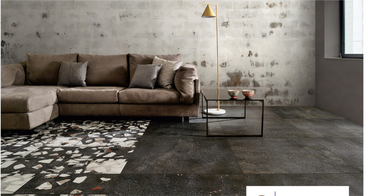
GRAFITE (Black) & GRAFITE (Black) Decor