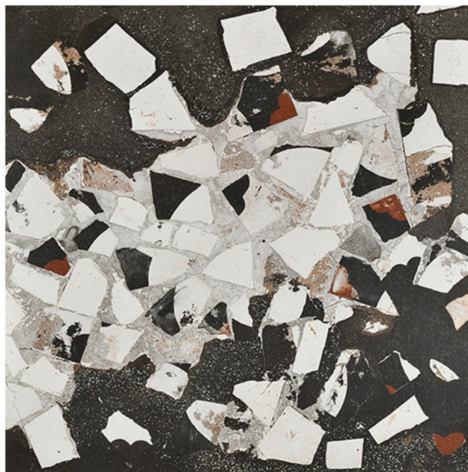
GRAFITE (Black) DECOR