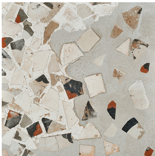
CENERE (Grey) DECOR