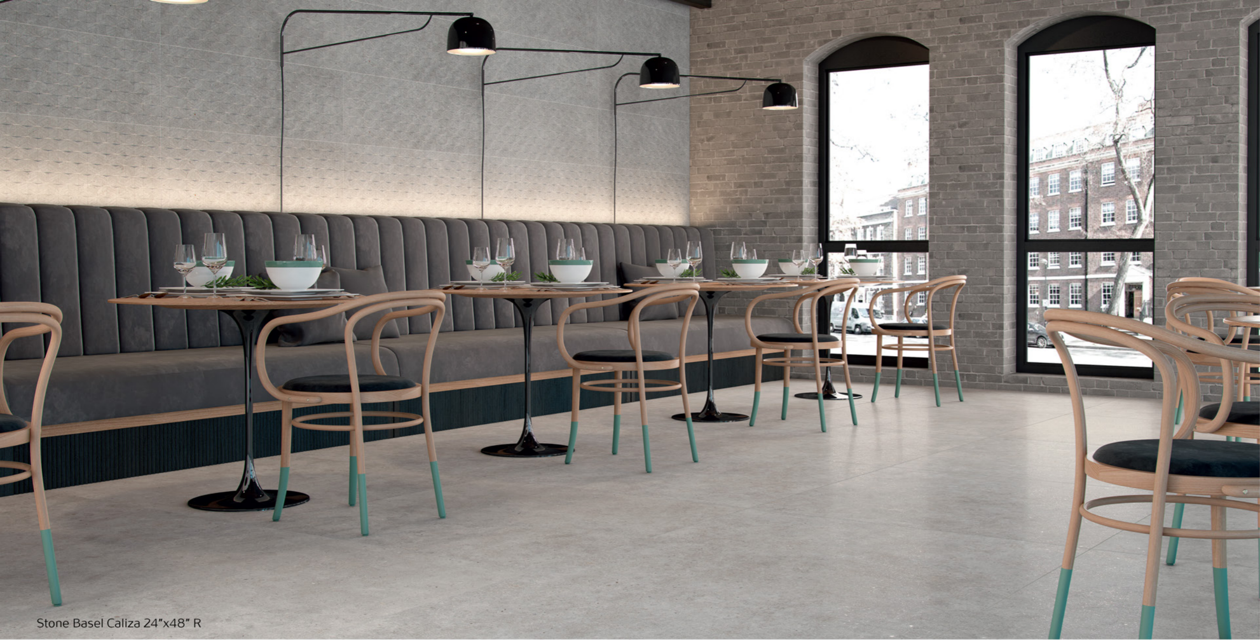
Stone Basel Caliza 24"x48" R