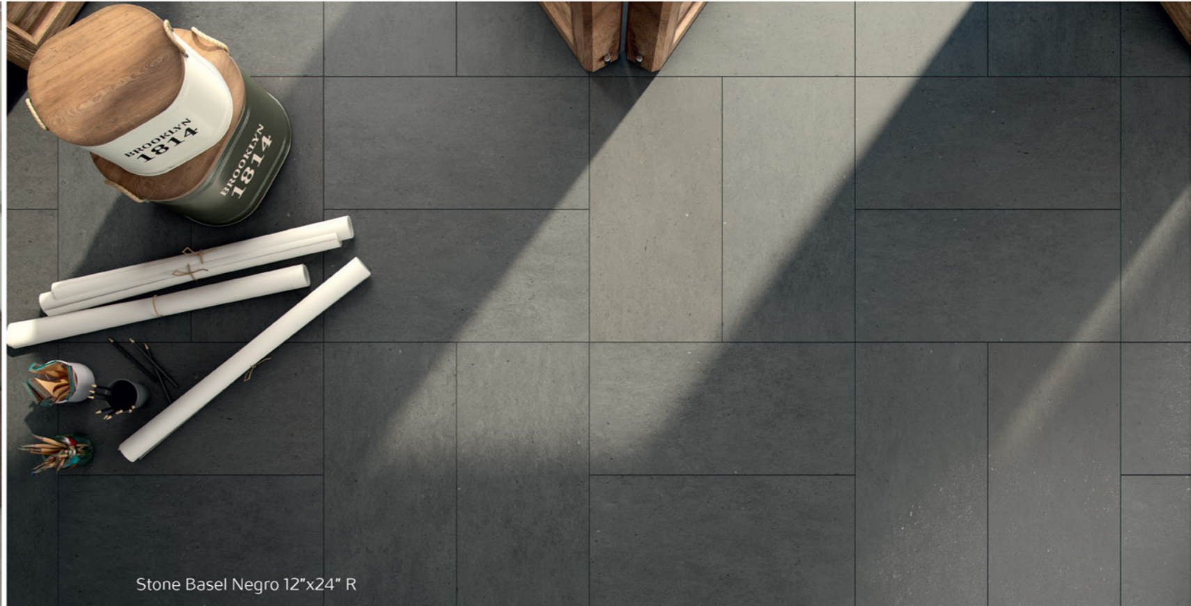
Stone Basel Negro 12"x24" R