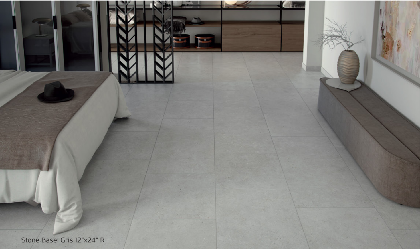
Stone Basel Gris 12"x24" R