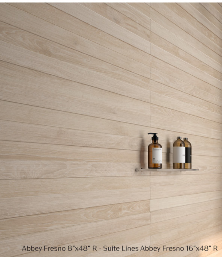
Abbey Fresno 8"x48" R - Suite Lines Abbey Fresno 16"x48" R

This Full Body Porcelain floor tile unfolds in traditional colors and shades: Fresno, Roble, Vison, and Gris. A high quality porcelain proposal with a natural or antislip finish for outdoor or water areas.