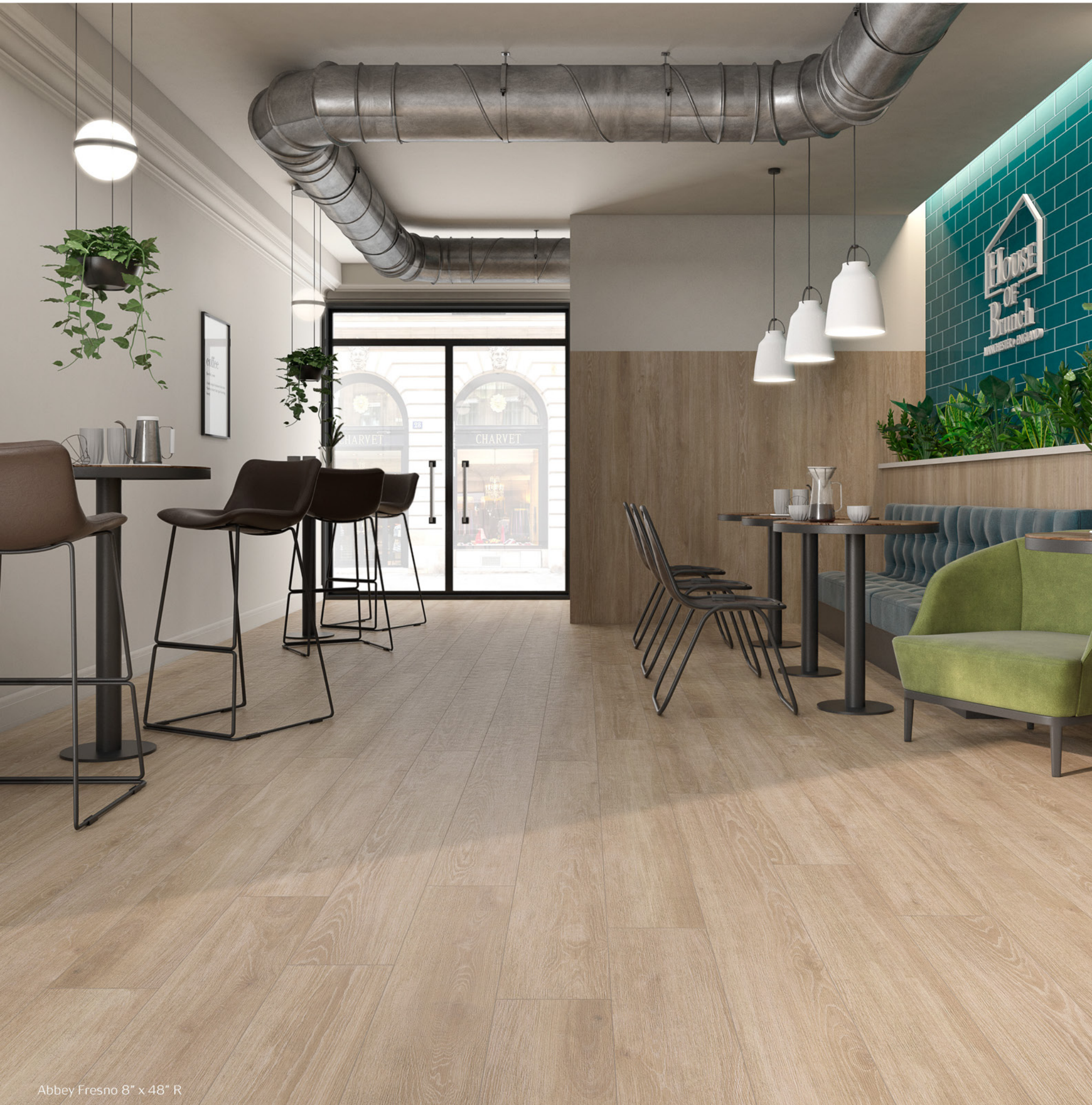
Abbey Fresno 8" x 48" R

The Abbey collection will give any interior the warm charm of untreated wood. A simple, unadorned floor that expresses its naturalness in long planks playing tribute to rustic floors.