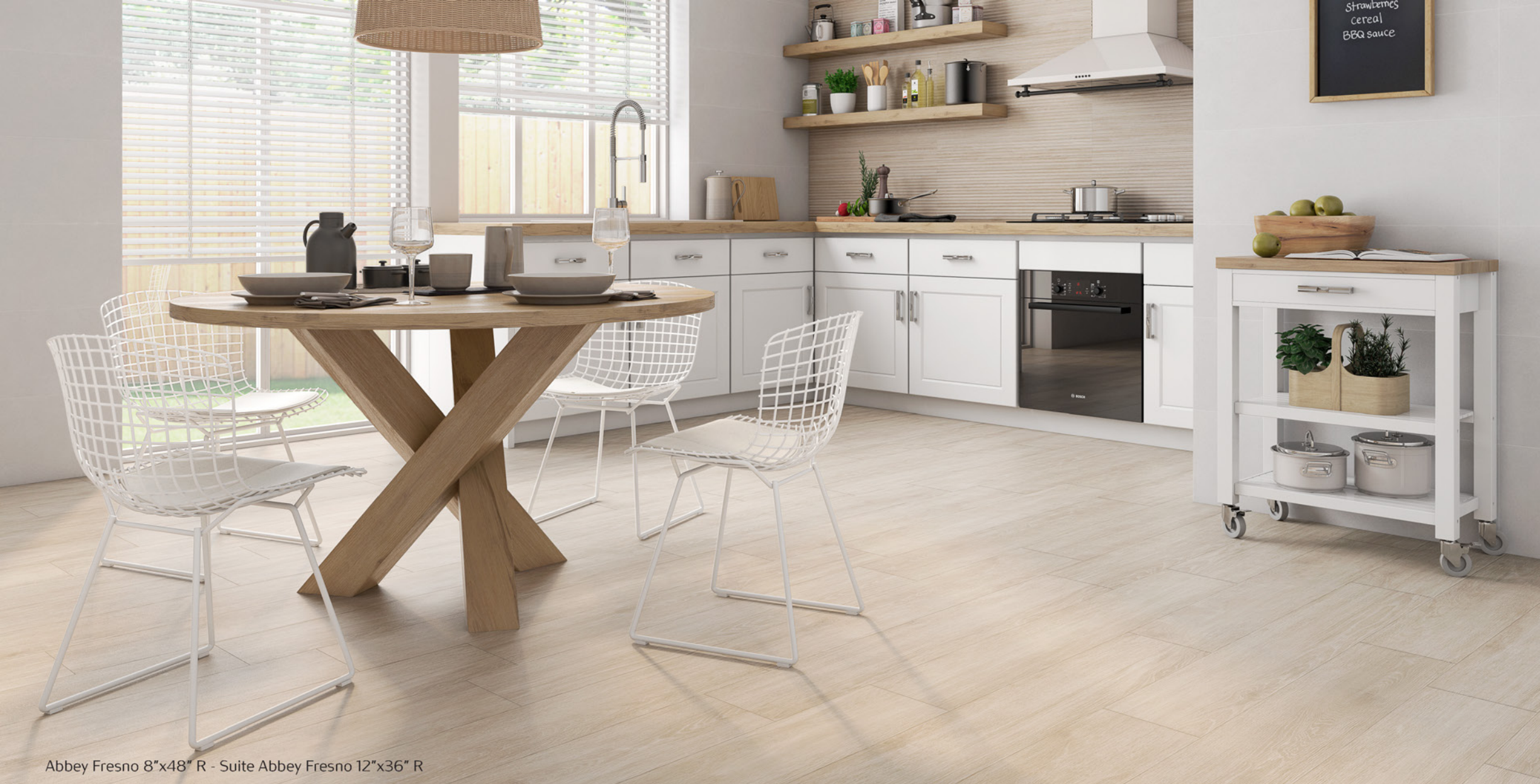
Abbey Fresno 8"x48" R - Suite Abbey Fresno 12"x36" R

This Full Body Porcelain floor tile unfolds in traditional colors and shades: Fresno, Roble, Vison, and Gris. A high quality porcelain proposal with a natural or antislip finish for outdoor or water areas.